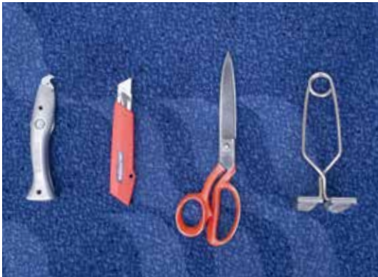
Tools from left to right: Carpet hook knife Utility knife Carpet shears Seam squeezer