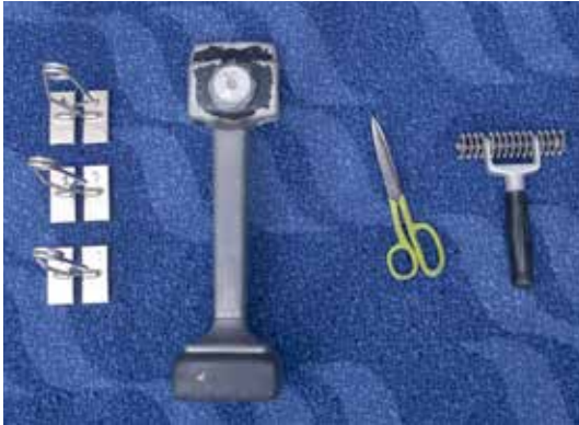
Tools from left to right: Seam squeezers Knee kickers Napping shears Carpet seam roller